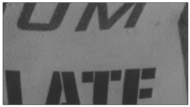
Figure 5 – Moisture condensation on packaged metal

with special paper, foam sheets or other materials to protect the surfaces against abrasion. Even though some interleaving papers contain an additive to inhibit water staining, the normal precautions during transit, handling, and storage should be followed. It is very important that the coil or sheet metal package is securely attached to the skid to eliminate any possibility of movement which can tear or otherwise compromise integrity of the packaging during shipping. Use of desiccants is not recommended due to rapid overload conditions that can occur during long routes and the very large quantity of moisture that can accumulate on cold surfaces.