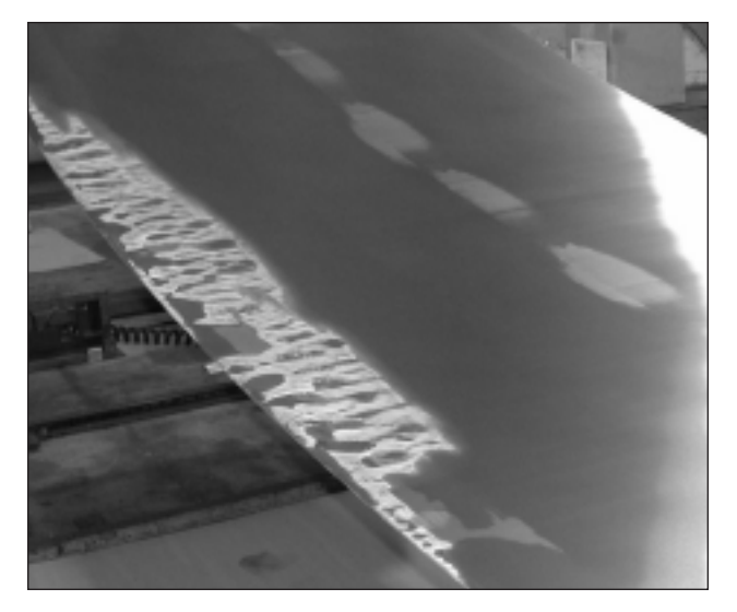
Figure 2 – Water Stain on Sheet