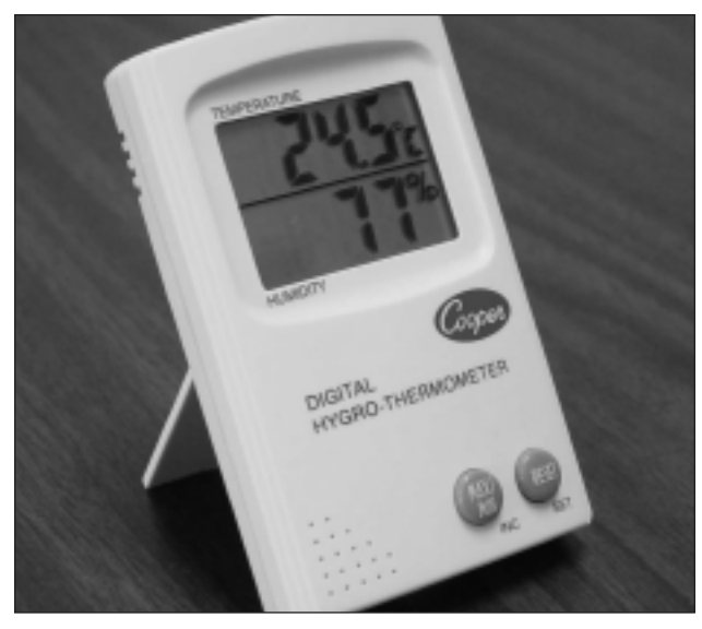
Figure 3 – Digital Instrument for Measuring Temperature & Humidity