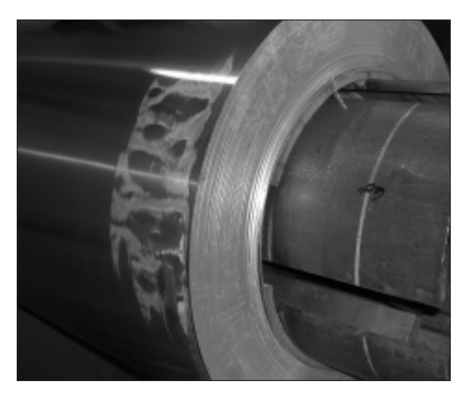
Figure 1 – Water Stain on Coil

Dew point is the temperature at which water vapor from the air begins to condense and is affected by the relative humidity and temperature of the air. The dew point can be determined from a chart (see Table 1), based on simple measurements of air temperature and relative humidity. The type of instrument used to measure (and log) temperature and relative humidity is shown in Figure 3. The older style of thermometers containing mercury should not be used because mercury from broken thermometers can corrode aluminum and other metals. Some suppliers of these instruments are listed in Appendix 2.A.