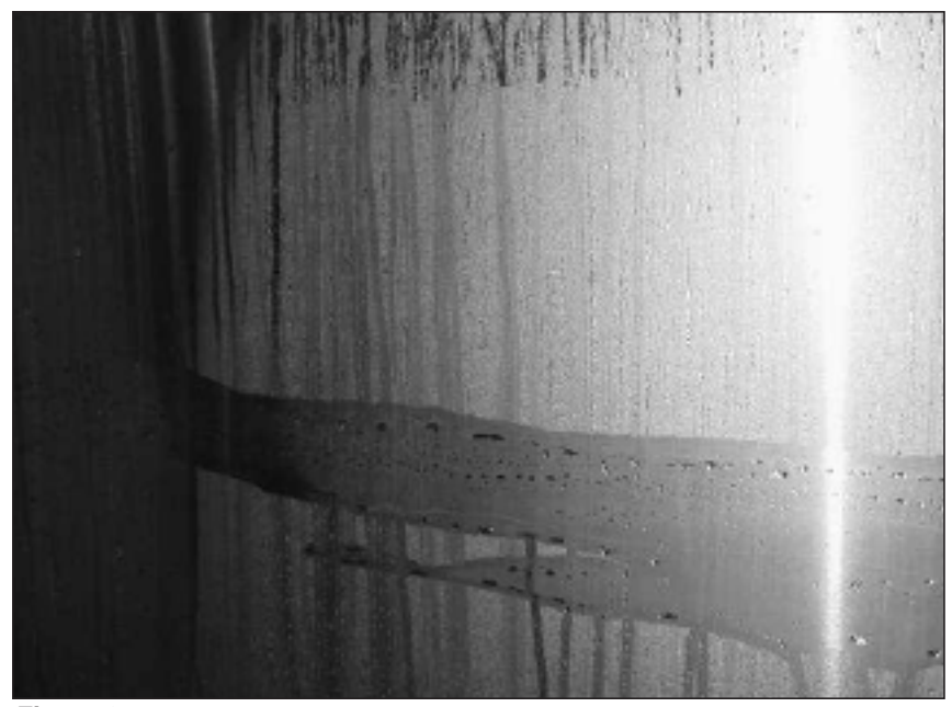
Figure 6 - Heavy Water Condensation on a Coil

B. Water vapor will condense on the surface of the metal if its temperature is lower than the dew point of the air in the storage area. (See Figure 6) It is important, therefore, to check the temperature of a few coils in every shipment and compare that temperature to the dew point of the storage area. (Refer to section 5. A.3)