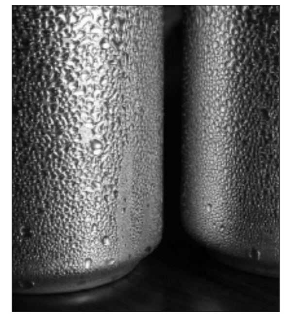
Figure 4 – Condensation on Cold Aluminum Cans

Water vapor condenses on the surface of a metal if the temperature of the metal drops below the dew point of the surrounding air. A familiar example of condensation is the fogging of one's eyeglasses upon entering a warm room after being in the cold outdoors. Another common example is condensation on a cold beverage can as shown in Figure 4. As mentioned before, when the temperature of aluminum drops below the dew point of air, water comes out of the air and deposits on the surface of the aluminum. The temperature of the aluminum can drop below the dew point of the air under the following circumstances: