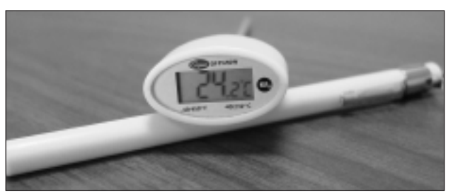
Figure 7 – Probe Thermometer

C. An alternative method of identifying coils exposed to moisture is through the use of moisture tags (a.k.a. "Weeping Eyes"). See Appendix 2.B. for a list of suppliers. These tags, made of moisture