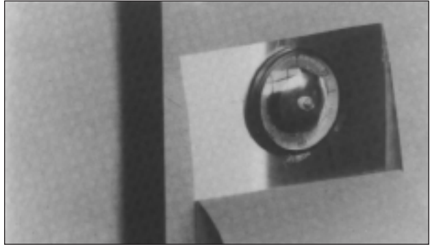
Figure 8 – Contact thermometer

absorbent material, can identify exposure to moisture by changes to the shape and/or color of the tag depending upon the specific indicator used. Figure 9 shows a new tag while Figure 10 shows the effect of exposure to a water mist. If the tag shows exposure to moisture, follow the directions in Appendix 1.