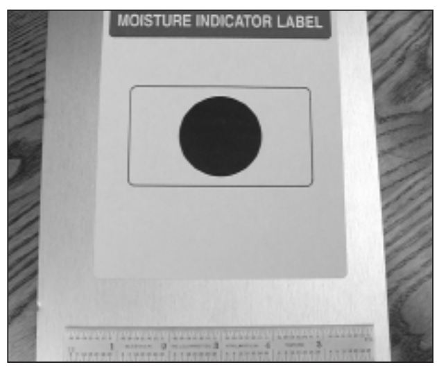
Figure 9 – Unexposed Moisture Label

absorbent material, can identify exposure to moisture by changes to the shape and/or color of the tag depending upon the specific indicator used. Figure 9 shows a new tag while Figure 10 shows the effect of exposure to a water mist. If the tag shows exposure to moisture, follow the directions in Appendix 1.