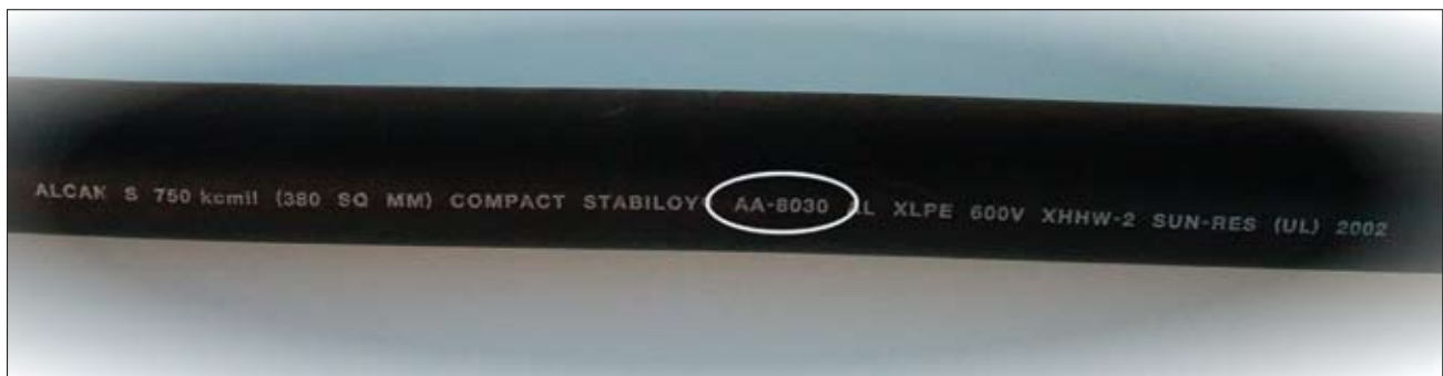
Photo 2. Legend on commercially available AA-8000 conductor

AA-8000 series aluminum conductors were first