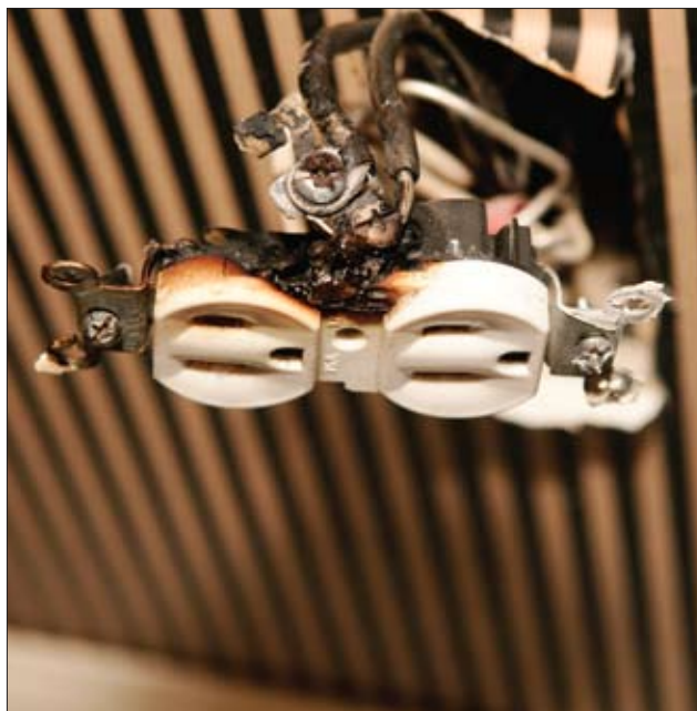
Photo 1. Aluminum wiring incorrectly installed on copper-only receptacle

Because the connections were often made incorrectly,