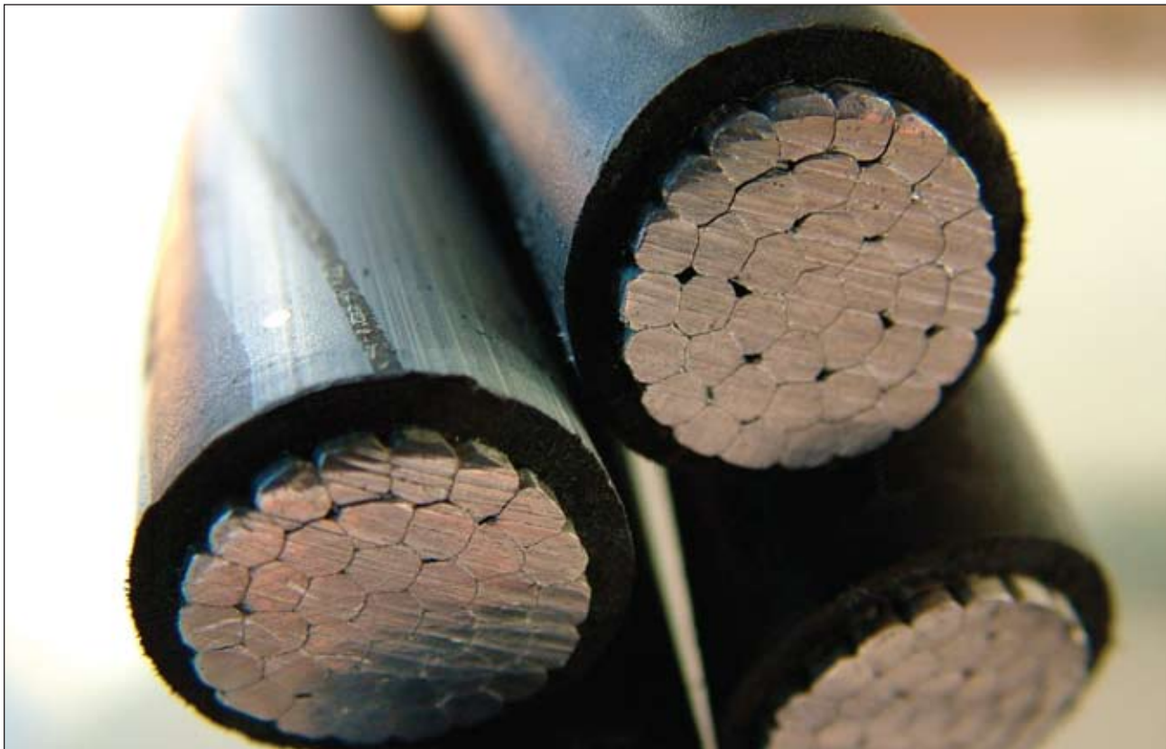
Photo 3. Compact stranded aluminum conductor

specifically required by the NEC in 1987. The language has remained virtually unchanged since then, and can be found in the 2005 NEC Section 310.14. AA-8000 series aluminum alloy conductors have physical properties that are significantly different from the previously used AA-1350 aluminum conductors. To identify these conductors in the field, look for the designation “AA-8XXX” in the legend on the conductor or cable assembly; these are the only type of aluminum building wire conductors that are UL listed.