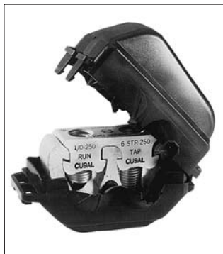
Photo 4. Connector markings

UL 486B allows aluminum connectors to be manufactured without this plating, but only for connectors rated for aluminum conductors only. Since the standard lug is dual-rated, it is plated with tin to prevent galvanic corrosion between the copper conductor and the aluminum connector.