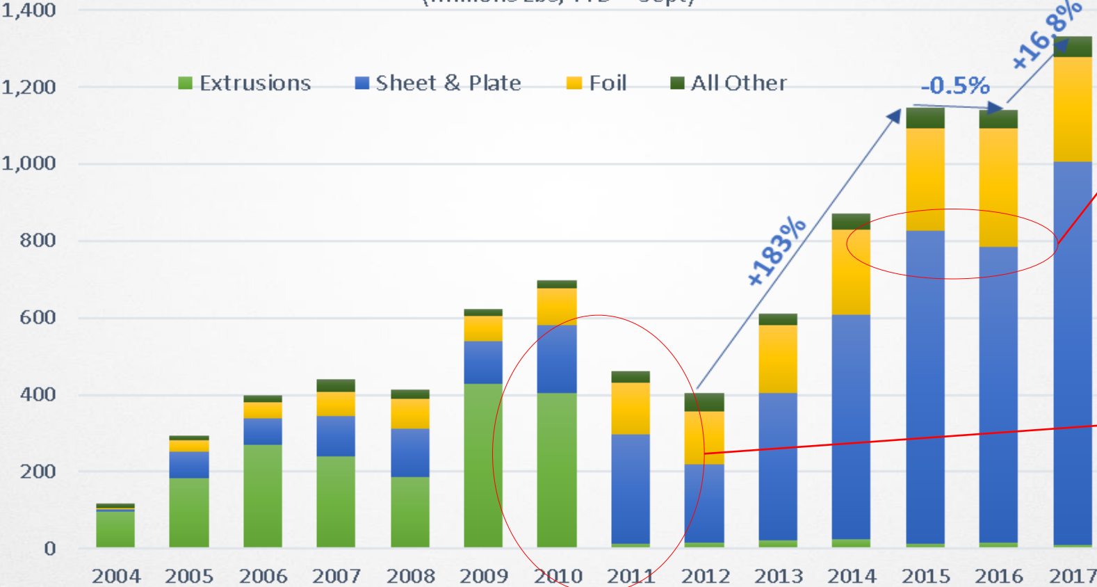
U.S. Imports of Chinese Semifabricated Products (Millions Lbs; YTD = Sept)

Decline from 2015 to 2016 due to the suspension of irregular and nontransparent trade practices (i.e. fake-semis). In this case, primary aluminum disguised as aluminum plate.